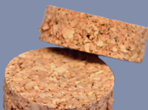
20GA 1/4" CORK WADS 14CW20 | #1222420