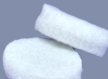
20GA 1/4" FELT WADS 14FW20 | #1221420