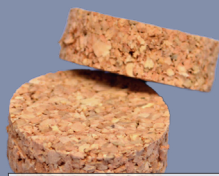
20GA 1/4" CORK WADS 14CW20 | #1222420