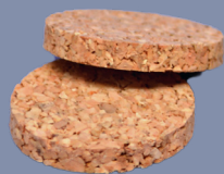
20GA 1/8" CORK WADS 18CW20 | #1222820