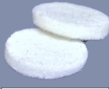
20GA 1/8" FELT WADS 18FW20 | #1221820