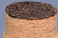
.410 1/2" FIBER WAD FC410 | #FC 410 .430 1/2" FIBER WAD FC430 | #FC 430