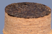
.410 1/2" FIBER WAD FC410 | #FC 410 .430 1/2" FIBER WAD FC430 | #FC 430

Filler & cushion wads occupy space below the pellets so that the load can be crimped properly. Remember, different payloads and different pellet sizes occupy different volumes, so you will want an assortment of sizes on hand. Overshot cards improve overall crimp quality and seal in small shot and/or buffer. We recommend .410 & .430 Bore fillers for inside the 28 gauge wads.