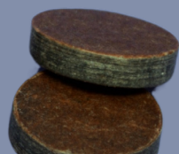
28GA 1/8" MAXI-NITRO CARD NC28 | #NC 28